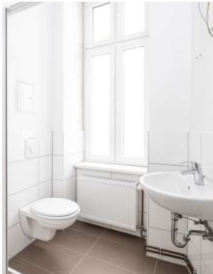
Flats in the building