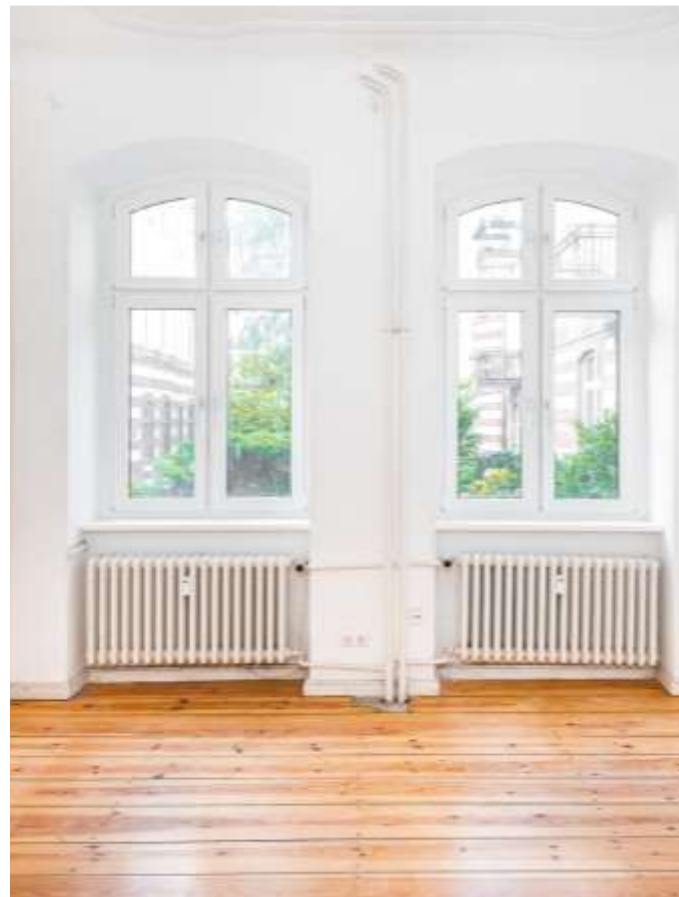
Example of a flat at the side wing