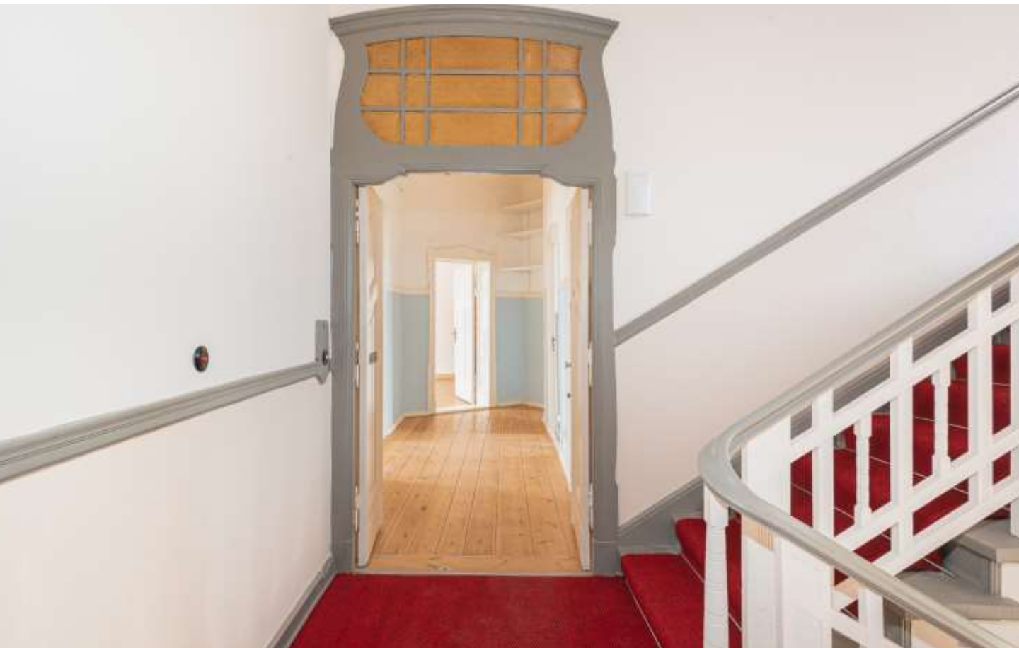
Example of a flat (WE9)