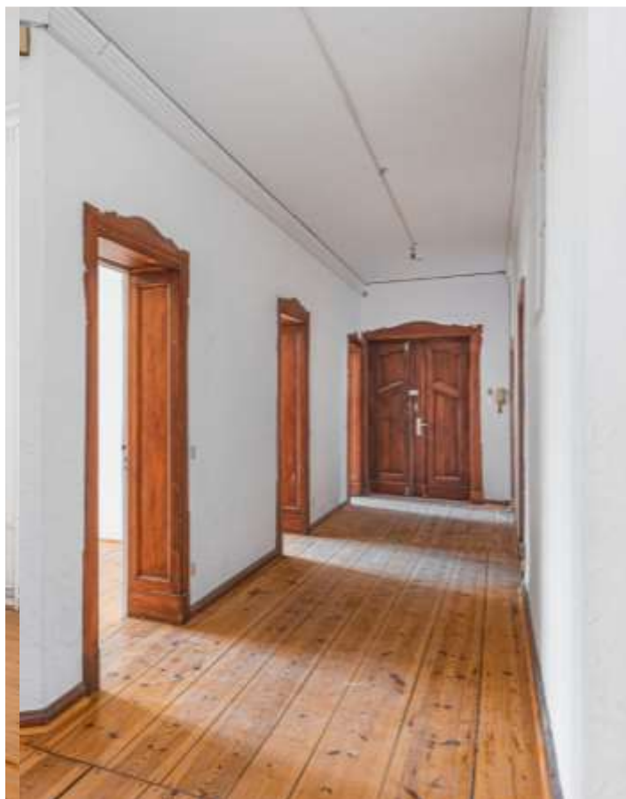
Example of a flat (WE8)